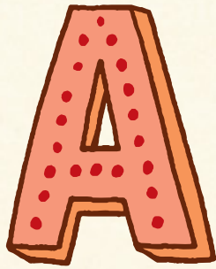
Background + Fill + Shadow + Dots