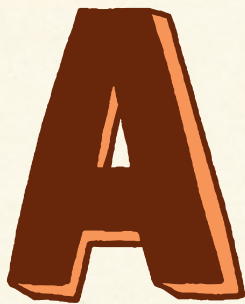
Background + Shadow