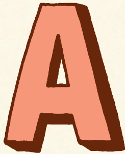
Background + Fill