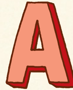
Background + Fill + Shadow