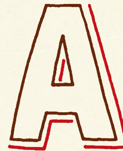
Outline + Shadow