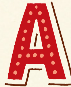
Stroke + Fill + Dots