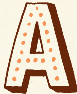
3D + Dots