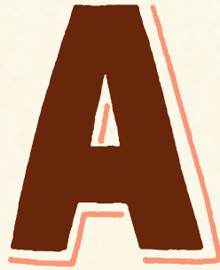
Regular + Stroke